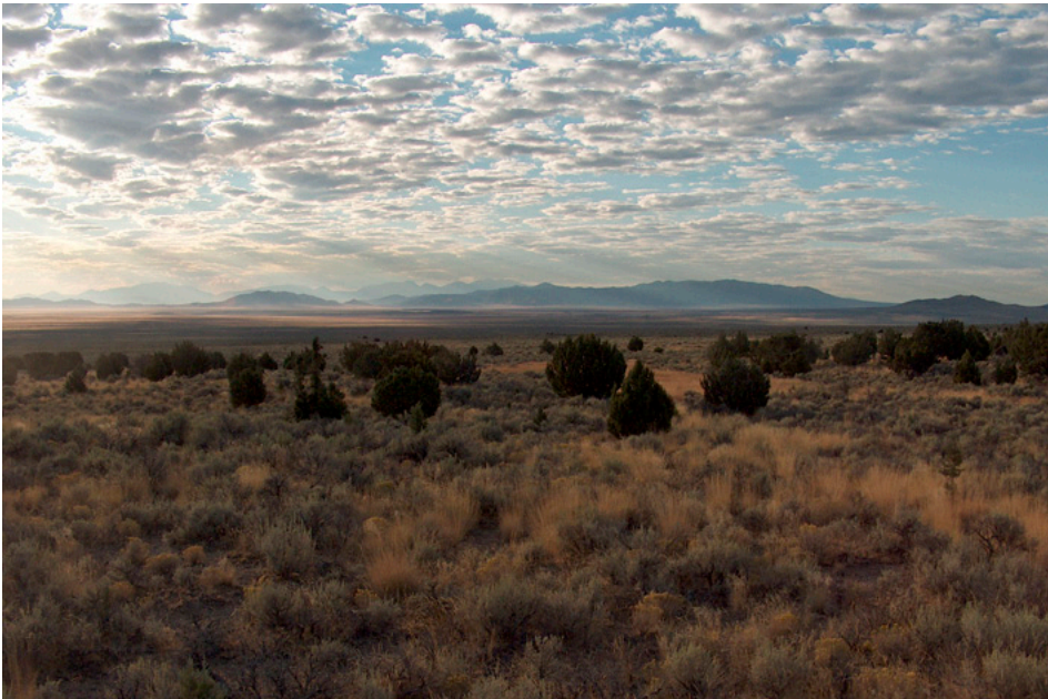
■ Dynamic landscapes. Sagebrush communities throughout the Great Basin are among the most threatened landscapes in North America. ( Sagebrush Steppe Treatment Evaluation Project (SageSTEP) )

Public land managers in the Great Basin aim to maintain and restore healthy ecosystems. Climate change, private development pressures, and invasive plants are just a few of the challenges they face. Without regional collaboration, stewardship of public lands can be expensive and ineffective. SageSTEP (Sagebrush Steppe Treatment Evaluation Project) is a model collaborative effort, made possible, in part, by the Cooperative Ecosystems Studies Unit Network that brought together six federal agencies, five universities, and one non-profit organization in six states.